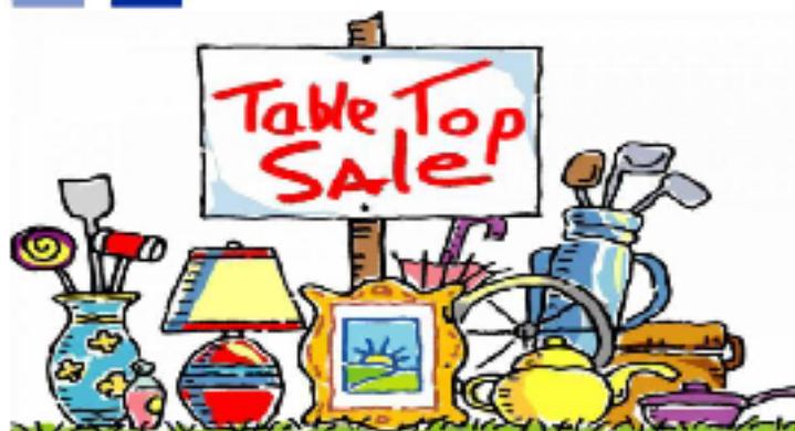
Table Top will be open Tuesdays October 14 th and 28 th 9.30am-12.00